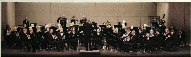
Joint concert, Sheldon High School