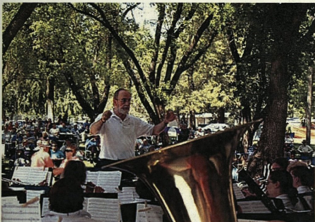
Community Band Festival, Carmichael Park

Sacramento Symphonic Winds P.O. Box 1503 Carmichael, CA 95609