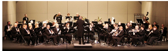
Joint concert, Sheldon High School

Sacramento Symphonic Winds P.O. Box 1503 Carmichael, CA 95609