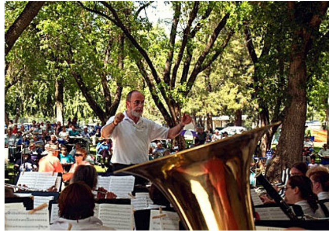
Community Band Festival, Carmichael Park

Fulfilling a mission to promote band music throughout the region for young and old, the Winds perform for civic, school, festival and social events. From patriotic marches to ballads and classical symphonic pieces to contemporary pops and rock 'n' roll, our programs feature a variety of music designed to entertain and appeal to our enthusiastic and appreciative audiences. Members are also available to perform in small ensembles for special events. For booking, please see the contact information on the front of the brochure.